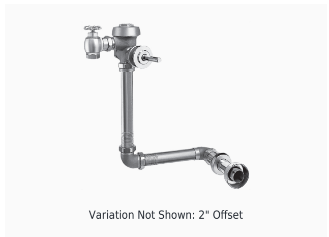
Variation Not Shown: 2" Offset